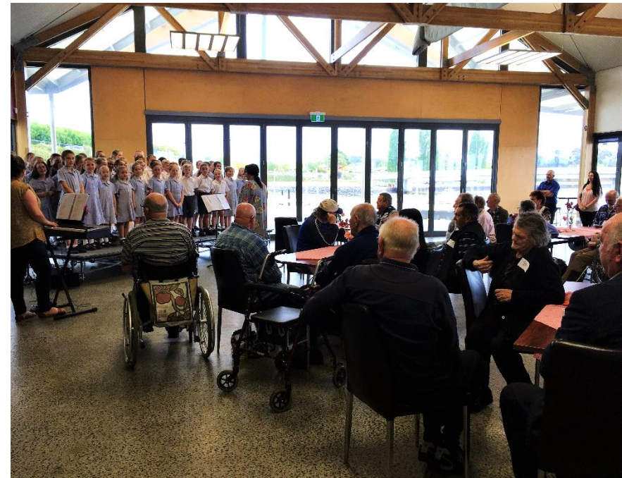
Connect Café: 20 November 2018