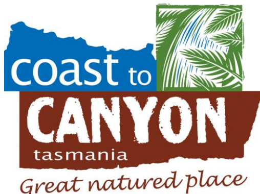
Figure 1: Coast to Canyon Tourism Place Brand

The Central Coast Place Marketing Plan 2017 identifies ways to stay in tune with consumer and travel trends and create a point of differentiation for Central Coast to compete as a destination in crowded marketplaces, including the visitor economy. Place marketing aims to communicate selective images of specific geographical localities or areas to a target audience. "Coast to Canyon" is the tourism place brand for Central Coast and is shown in Figure 1. The Coast to Canyon "Great Natured Place" brand has a strategic capital framework and marketing positioning. The "...it's in our nature" message has been designed to target various audiences such as visitors, new business or locals 10 .