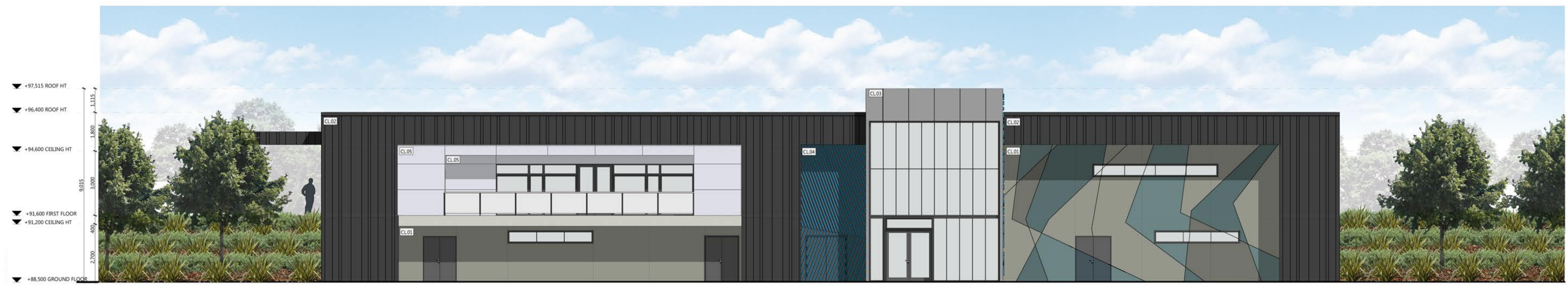
E4 WEST ELEVATION SCALE 1:100 0mm 1000 2000 3000 4000 5000