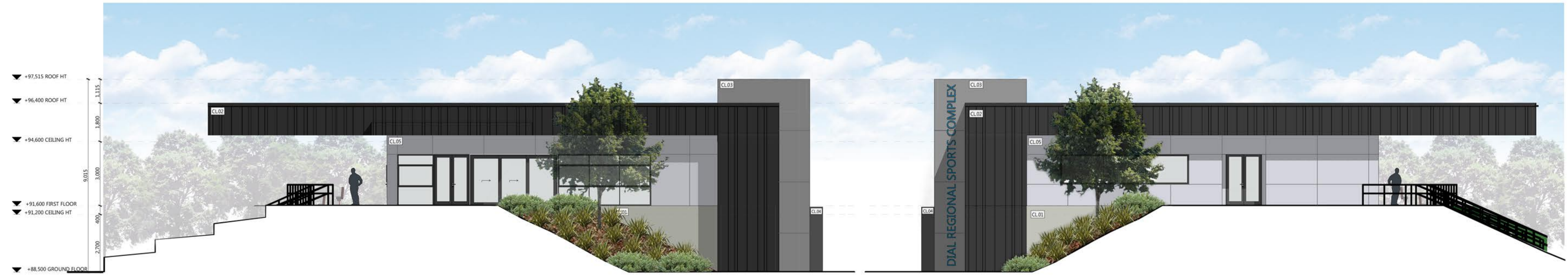
E1 NORTH ELEVATION SCALE 1:100 0mm 1000 2000 3000 4000 5000