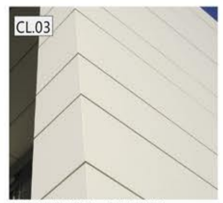
CL03 CLADDING NO. 03 - COMPOSITE ALUMINIUM PANEL, METALIC GREY.