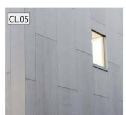
CL05 CLADDING NO. 05 - FIBRE CEMENT SHEET PANELING, COLOUR TO MATCH DULUX LEXICON HALF.