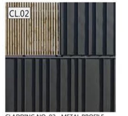
CL02 CLADDING NO. 02 - METAL PROFILE STANDING SEAM, COLORBOND MONUMENT